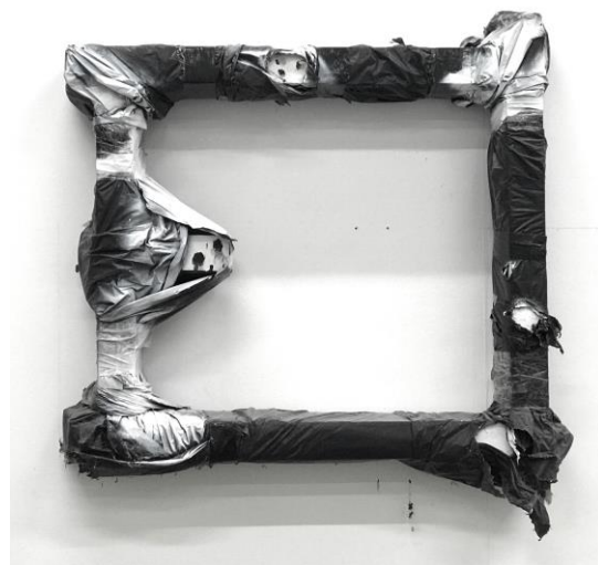
Fig. 1 (Below)

(See mock up sketch of proposed space below also, Fig. 4 and Fig. 5 ) I am currently finishing off the first piece titled Frayed ( Fig. 1 ) and a Wear (see Fig. 2 ) and aim to create a further 2 pieces in the similar style as I find it to be most successful. The fifth and final piece will be a small stool placed directly under and in conjunction with the works. Layouts and how I will link the 4 wall mounted works will be subject to alteration and changes once all are finished and I have had time to experiment with their placement. Potentially I will link the 4 works and the chair together with the same binding I utilise in the individual works (i.e connecting them with sinuous strands and wrappings of bin bags).