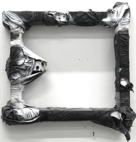
Fig. 1 (Below)

I still plan on linking the 4 works with the same binding I used with the individual works (i.e connecting them with sinuous strands of bin-liners). This will be explored once full-size works are completed.