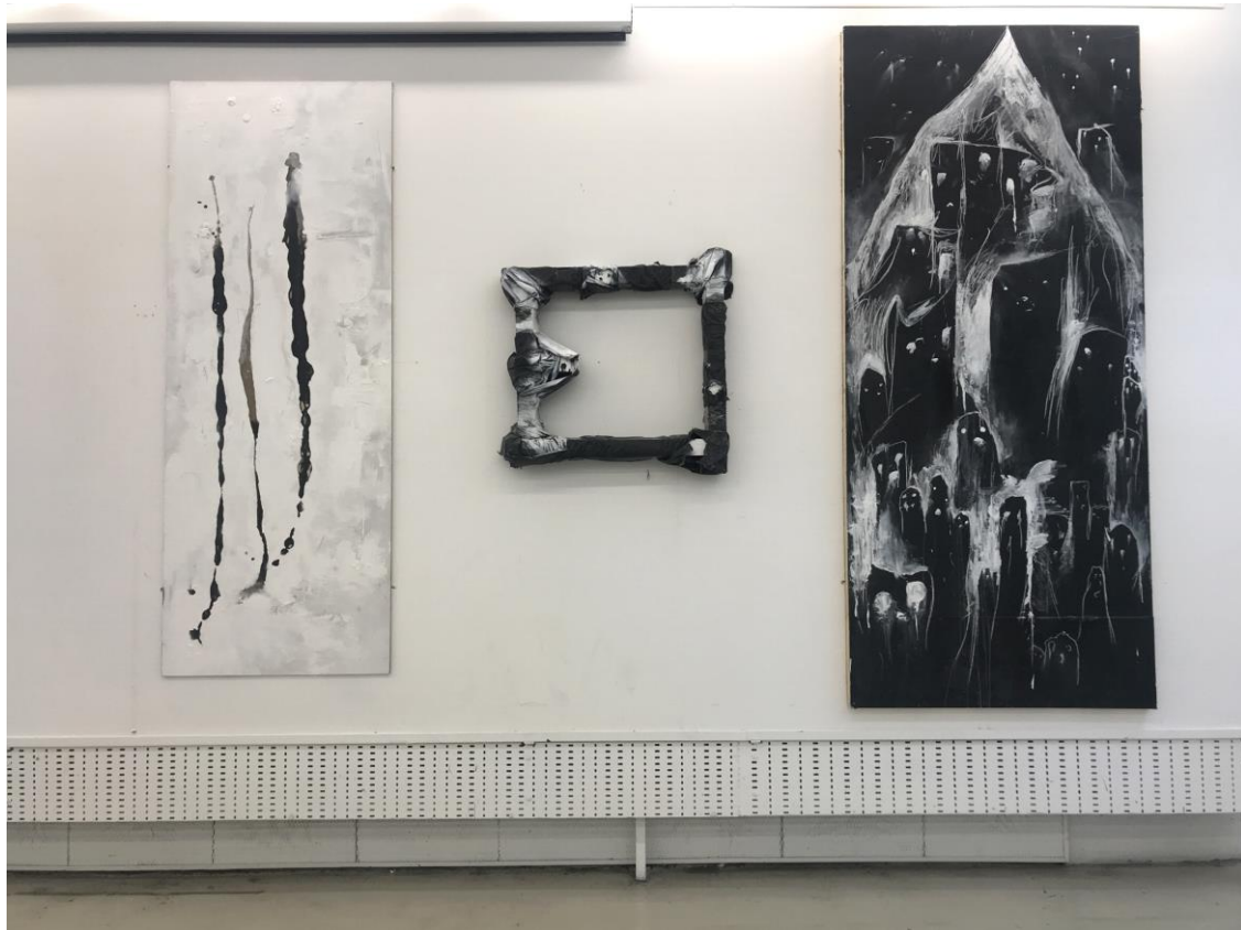
Fig. 3 (Above)

*DIMENSIONS/SPACE: Indicate the approximate dimensions of the work that you plan to install (or dimensions of installation space / or specific identity of space if this applies):